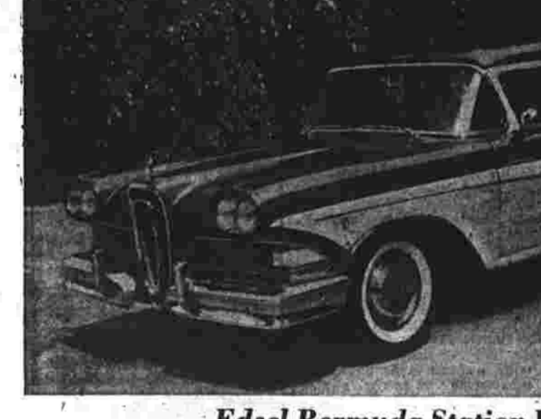
Edsel Bermuda Station Wagon

Beck Sr. had been sentenced to three years on two counts of grand larceny for misappropriating $4,600 from the sale of two union cars.